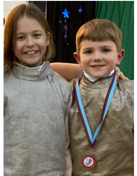
Happy learning in Pre-prep; proud Fight Night finalists; and our glorious grounds in the frost, as captured by Year 5 in their Enquiry lesson.